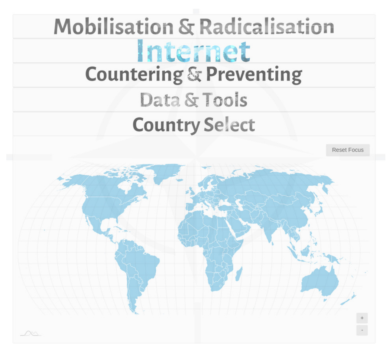
Figure C-4: Interactive Map Allowing for Geographic Filtering by Country(ies) of Interest.